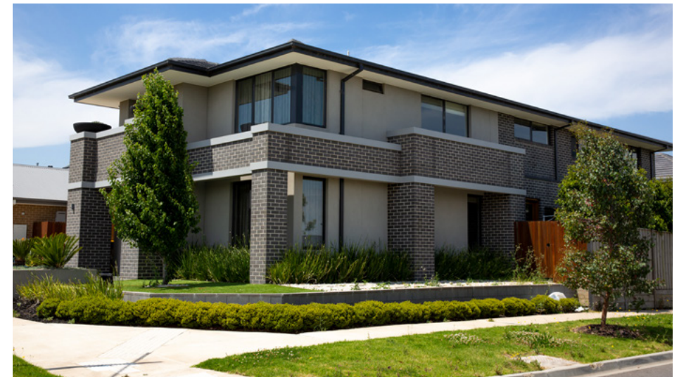
Double Storey Corner Treatment. Credit: Porter Davis