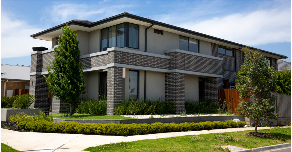
Double Storey Corner Treatment.