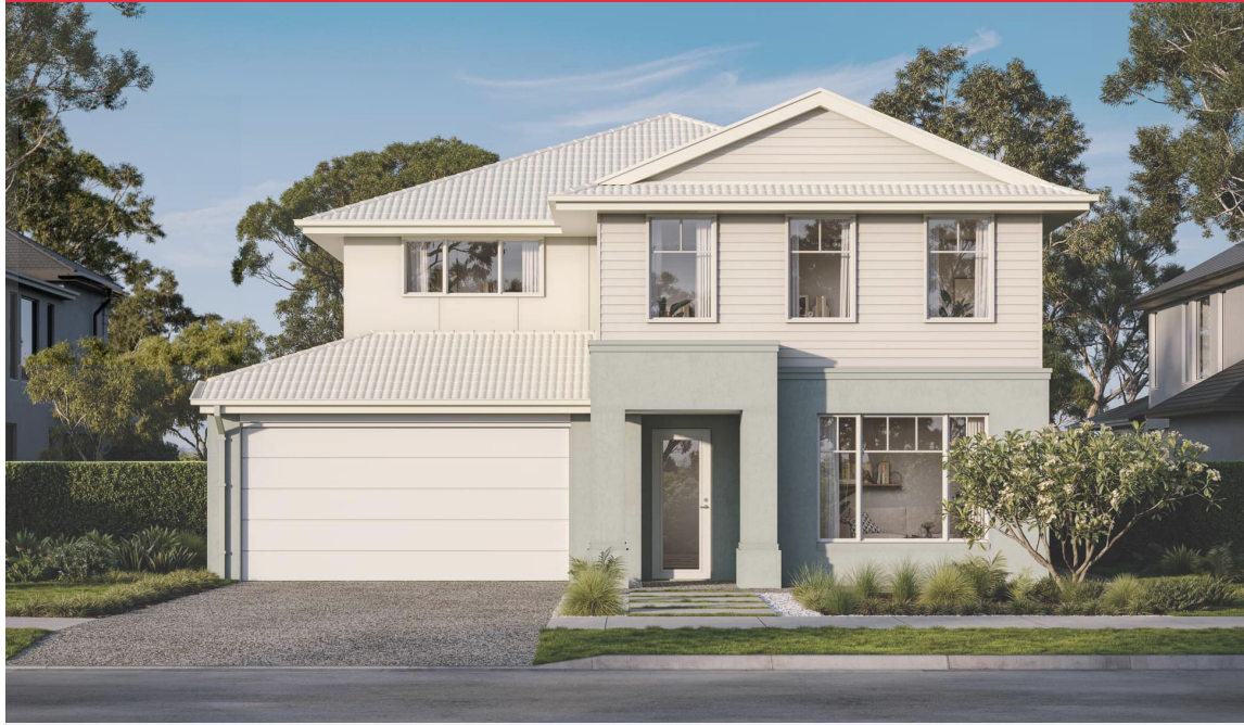
VASSE 27 | ELEVATE RANGE