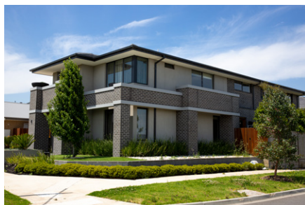
Double Storey Corner Treatment.