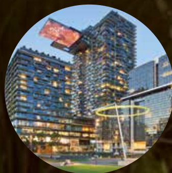
Central Park, Sydney NSW