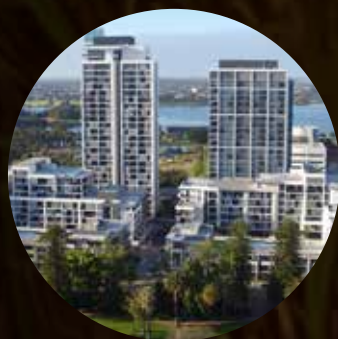
Queens Riverside, Perth WA