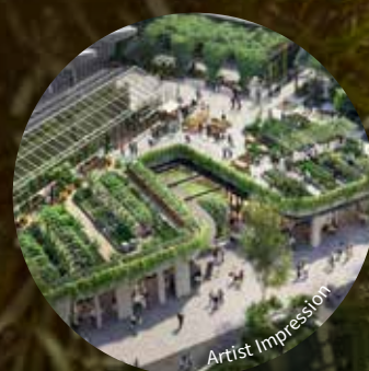
Burwood Brickworks, Burwood VIC