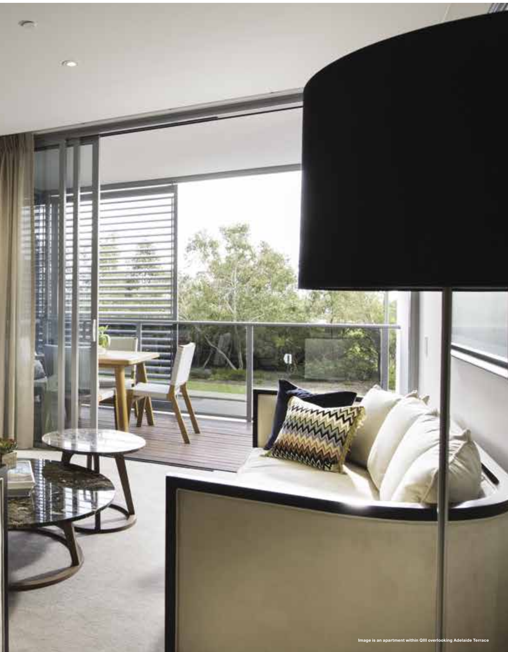
Image is an apartment within QIII overlooking Adelaide Terrace