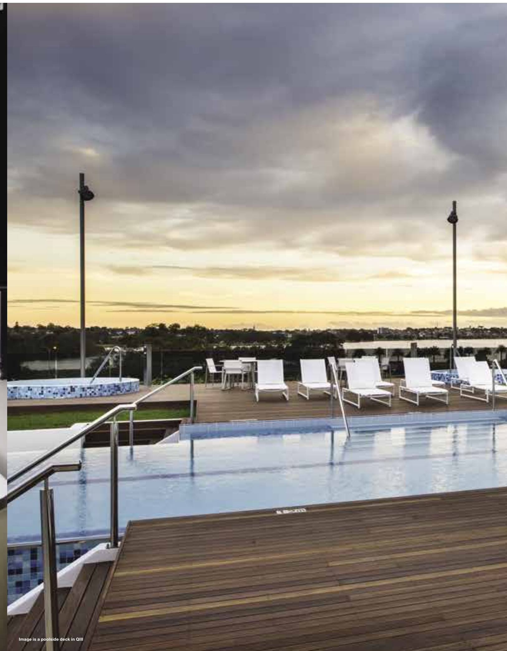
Image is a poolside deck in QIII