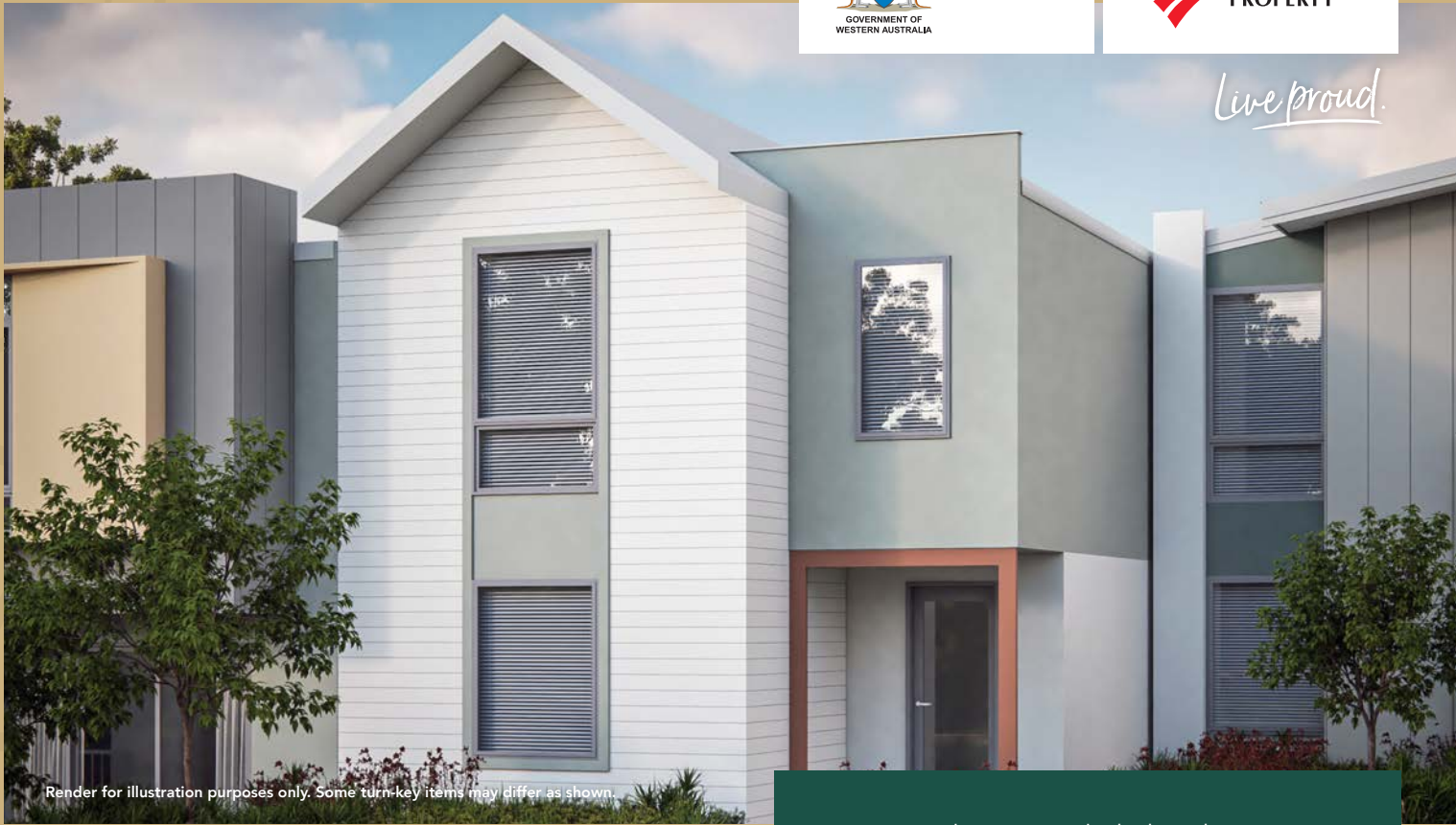
Render for illustration purposes only. Some turn-key items may differ as shown.