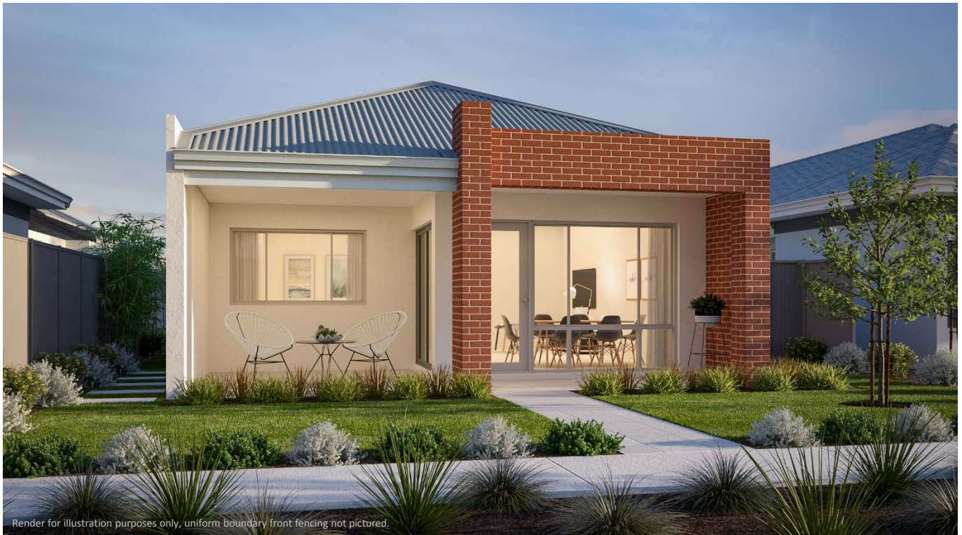
Render for illustration purposes only, uniform boundary front fencing not pictured.

Call Ryan Severn on 0421 499 417 or Email Ryan.Severn@frasersproperty.com.au